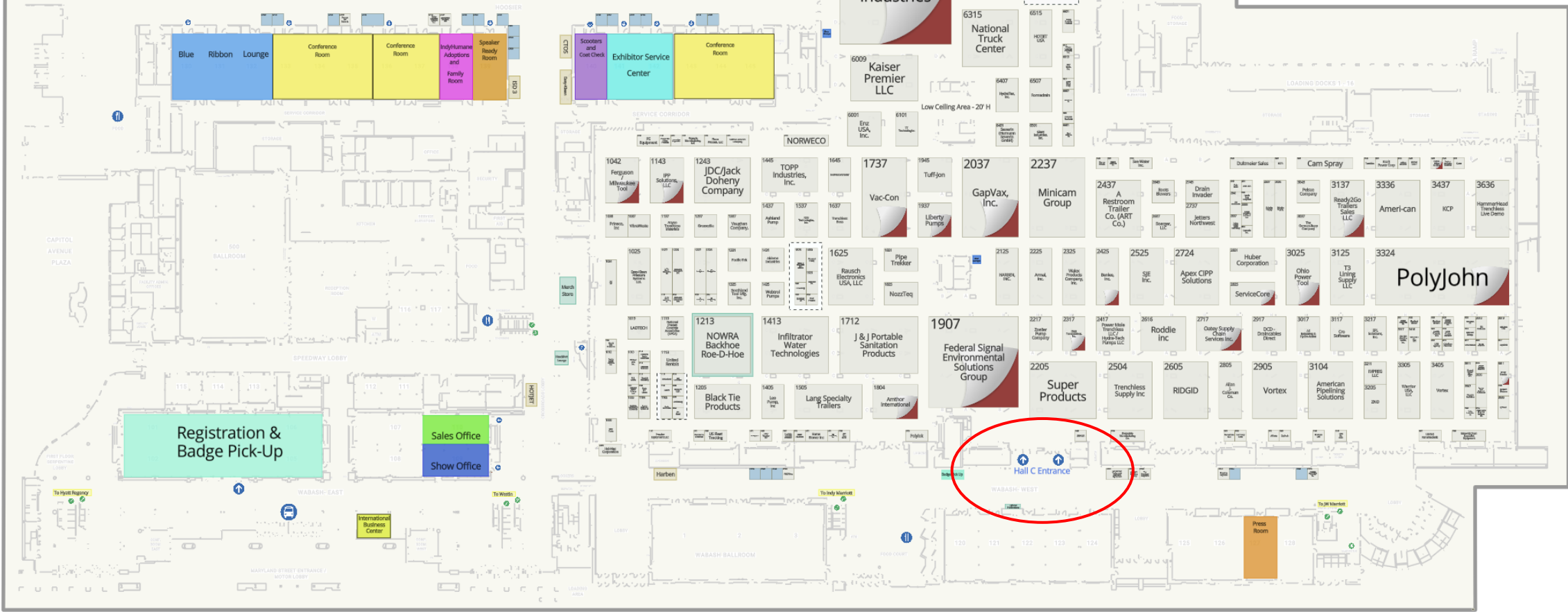
Hall C Entrance (via Wabash West Lobby)